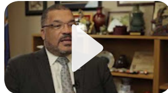
COMMUNITY IMPACT: For a better us