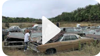
IDLE HANDS: For a better us