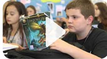
MIDDLE SCHOOL AFTER SCHOOL: For a better us