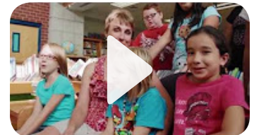
SPLASH | LIVESTRONG | JOB PREP: Three Stories