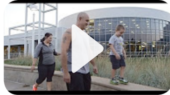
HEALTHY LIVING, HEALTHY FAMILY: The Dillard's Story